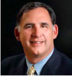
JOHN BOOZMAN (R)