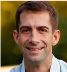
TOM COTTON (R)

141 Hart Senate Office Bldg. Washington, D.C. 20510 (202) 224-4843 (202) 228-1371 Fax